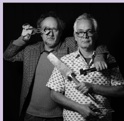
de la Torre Brothers: Latin Exoskeleton

Choose TWO featured exhibitions for your visit. For a complete list of current and upcoming exhibitions and their descriptions, visit mcnayart.org/exhibitions .