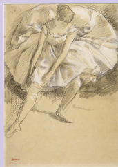
A Particular Beauty: 19th-Century French Art at the McNay